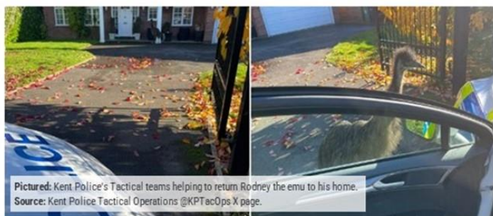
Pictured: Kent Police's Tactical teams helping to return Rodney the emu to his home.

How would you feel if there was a friendly Emu in your garden?