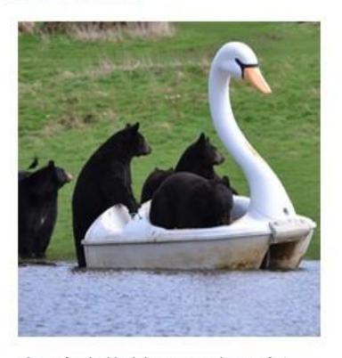
Pictured: The black bears at Woburn Safari Park ride on a swan pedalo.