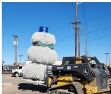
Pictured: The AMAFCA Tumbleweed Snowman being moved into position and on display beside the I-40.

Do you enjoy writing poems? Have you written one to celebrate an event?