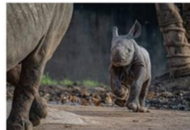
Pictured: Eastern black rhino Zuri and her new calf.

Do you know any facts about rhinos? Have you ever seen a rhino?