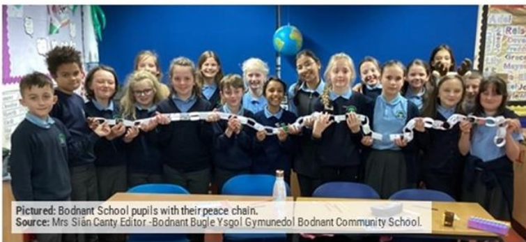
Pictured: Bodnant School pupils with their peace chain.

This month, we have launched our Picture News 'Let's Spread Peace' campaign. The campaign aims to spread peace by asking you to make your very own peace chain, with each link in the chain representing an action you feel will help to spread peace far and wide! In the past few weeks, you have amazed us by sending in photos of your fantastic creations! We believe that small acts of kindness help us spread peace in our communities and homes and can make a real difference. So, we have absolutely loved seeing what you have been making so far and hope to see more.