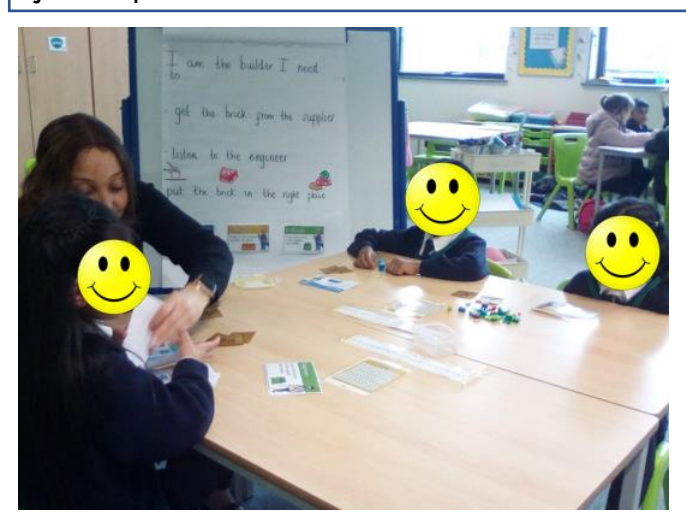
Have a great half-term!

Our wonderful LSAs have been running weekly Lego Clubs throughout the school. LEGO-Based Therapy is a social development program that uses LEGO activities to support the development of a wide range of social skills within a group setting such as social interaction, turn-taking skills, sharing, collaborative problem-solving and the learning of concepts.