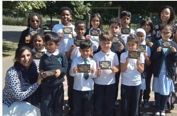
Attendance Winners for week beginning Monday 12<sup>th</sup> May 2025