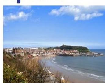
Pictured: A view of Scarborough.

It has recently been reported that plans to build a 650m zip wire in Scarborough, North Yorkshire have been submitted. Big Bang Promotions, an adventure tourism and activity provider, has said it would like to build four zip lines, each 650m in length in the seaside town! The company says the experience would start in front of the town's Open Air Theatre in North Bay and head towards the Scalby Mills miniature railway station, offering panoramic views out over the North Bay along the way. The clifftop zip line adventure experience would launch from a temporary, steelframed, 33m-tall tower, which can be put