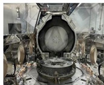
Pictured: The OSIRIS-REx asteroid sample return canister.

Share your thoughts and read the opinions of others