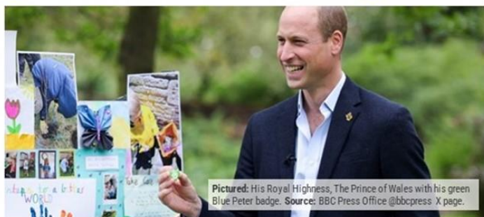
Pictured: His Royal Highness, The Prince of Wales with his green Blue Peter badge.