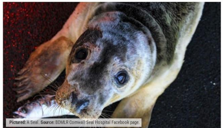
Pictured: A Seal.

Do you think you would enjoy volunteering to help animals?