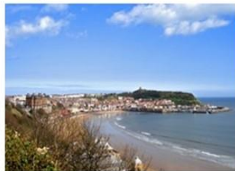
Pictured: A view of Scarborough.

It has recently been reported that plans to build a 650m zip wire in Scarborough, North Yorkshire have been submitted. Big Bang Promotions, an adventure tourism and activity provider, has said it would like to build four zip lines, each 650m in length in the seaside town! The company says the experience would start in front of the town's Open Air Theatre in North Bay and head towards the Scalby Mills miniature railway station, offering 'panoramic views out over the North Bay' along the way. The cliff-top zip line adventure experience would launch from a temporary, steel-framed, 33m-tall tower, which can be put