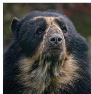
Pictured: Andean bear Oberon.