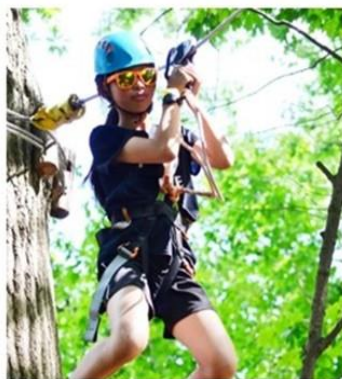
Pictured: A person on a zip wire.

It has recently been reported that plans to build a 650m zip wire in Scarborough, North Yorkshire have been submitted. Big Bang Promotions, an adventure tourism and activity provider, has said it would like to build four zip lines, each 650m in length in the seaside town! The company says the experience would start in front of the town's Open Air Theatre in North Bay and head towards the Scalby Mills miniature railway station, offering 'panoramic views out over the North Bay' along the way. The cliff-top zip line adventure experience would launch from a temporary, steel-framed, 33m-tall tower, which can be put