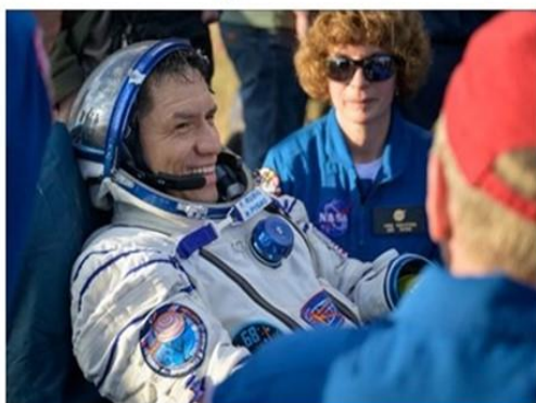
Pictured: NASA astronaut Frank Rubio in Kazakhstan as he landed back on Earth.

A NASA astronaut and two Russian cosmonauts have returned to Earth after an unplanned extended stay in space. The trio, who were stuck in space for just over a year, have safely landed in a remote area near Zhezkazgan, Kazakhstan. The original mission was scheduled to last 180 days. American astronaut, Frank Rubio, has set a record for the longest US spaceflight, after being away from home for 371 days. They couldn't come back to Earth from the International Space Station as planned because their original return capsule was hit and damaged by space junk. The Soyuz MS-23 capsule was then launched in February as a replacement to bring Frank