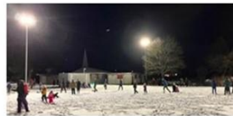
Picture: The community fun snowball fight at Strathburn Park.

How do you think it would feel to be involved in a snowball fight with hundreds of people? How many people do you think have been in the largest snowball fight ever?