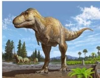
Picture: An image of Tyrannosaurus mcraeensis released by the New Mexico Museum of Natural History and Science.