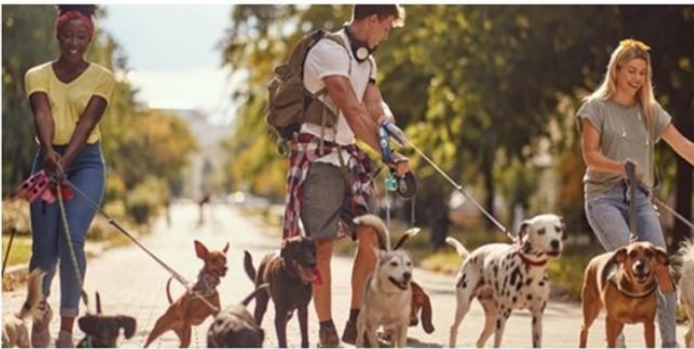
Pictured: A Dog Walk.

Researchers from Max Planck Institute for Psycholinguistics in the Netherlands and the University of Rome have been looking into why dogs might wag their tails. The four scientists have recently published their results and some of them might surprise you! Most people think that dogs wag their tails when they are happy or excited, but this may, in some cases, show nervousness or submission. The scientists said they found that dogs wag their tails much more than other animals that are closely related to them, for example, wolves. Canines in the wild use their tails to improve their balance and to swat away insects. These experts looked at the existing research on tail-wagging and concluded that there may be two reasons why dogs wag their tails so much. The