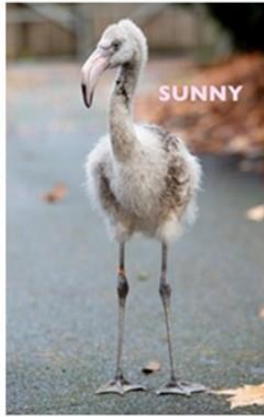
Pictured left: Flamingos. Pictured right: Sunny the flamingo chick.

Fast-thinking flight attendant, Amber May, received a unique request from one of the people on board the plane she was working on. The passenger, a zookeeper, had a very unusual problem and needed help building a nest! They were transporting rare flamingo eggs from Atlanta Zoo in Georgia, USA, to Woodland Park Zoo in Seattle, when their incubator broke. They asked the surprised flight attendant to help them keep the six eggs safe and warm. With hours of flight left to go, Amber came up with a plan – filling rubber gloves with warm water to keep the eggs at the correct temperature, which she refilled as the water inside cooled. Other travellers helped too, sharing their coats and scarves to keep the precious eggs insulated. The idea worked! All six eggs made it safely to