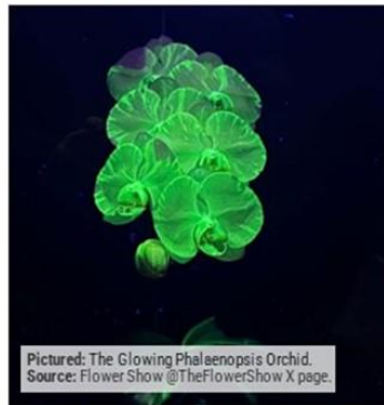
Picture: The Glowing Phalaenopsis Orchid.

The world's first fluorescent orchid has been displayed in Tokyo at the Japan Grand Prix International Orchid and Flower Show 2024. The Glowing Phalaenopsis Orchid emits yellow-green fluorescence under black light – not just the petals but the whole plant can be seen to glow! The luminous moth orchid was developed using the gene of a fluorescent plankton by scientists from Chiba University. The flower festival is described as one of the biggest and most extravagant orchid exhibitions in the world, and this year's exhibition will feature more than a thousand different orchid species. To enter the event, visitors will pass under the beautiful 'Orchid Gate' made from 100,000 orchids. As well as exhibiting groundbreaking and beautiful flowers, the show will create a platform for the world's best flower artists to show their skills. At the festival's opening ceremony, Princess Tsuguko of Takamado said, 'I would be glad if this exhibition became an opportunity for people to consider the importance of preserving biodiversity.'