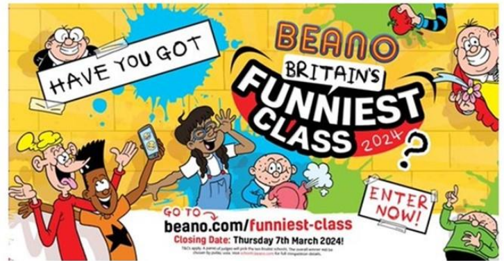
Picture: How to apply to be named Beano Britain's funniest class.

Beano, the world's longest-running comic, has announced its search for Britain's funniest primary school class! The comic posted on X, 'Help Class 2B in their search for Britain's Funniest Class (and teacher)! 😊 As much as The Bash Street Kids love a bit of hard work (ha!), a little help wouldn't hurt... 🤖 If you think your students have the gift of the gag, enter now.' The well-loved children's comic is celebrating the Bash Street Kids' 70 th anniversary with the launch of 'Britain's Funniest Class 2024' competition. Teachers can submit their classes' hilarious gags and jokes via the website before the closing date on 7 th March. The most side-splitting entries will then be put to a public vote, resulting in one comical class being named the