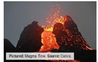
Pictured: Magma flow.

The Krafla Magma Testbed (KMT), in a remote area of Iceland, has been announced as the world's first magma observatory. KMT's website said the research facility, open to all, will have access to a magma chamber (an underground reservoir of molten rock). Scientists plan to drill down to the magma chamber, so that they can observe and experiment on the magma to see how it behaves and reacts whilst underground. This will give them a greater understanding of magma, volcanoes and help to improve volcano prediction. The world's first tunnel to a magma chamber also has the potential to unleash unlimited energy, using geothermal power. Geothermal energy is the heat produced deep in the Earth's core. It is a clean, renewable resource that can be used for heat and electricity. Two boreholes will be drilled, one will give scientists their first direct measurements of magma and the second could help to supercharge geothermal power, giving access to tons of green