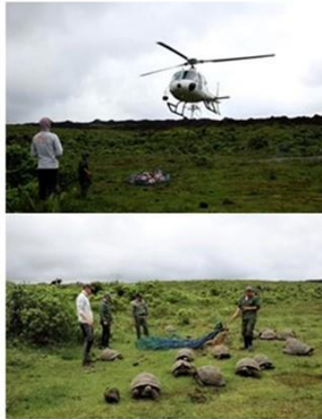
Pictured: Galápagos tortoises being airlifted and released on the island.

136 Giant Galápagos Tortoises have been returned to their natural habitat by conservationists. The Galápagos National Park Directorate, working with the Galápagos Conservancy, successfully transported the young tortoises by helicopter! Flying was determined to be the safest and least impactful way to transfer the endangered animals. The other option being multiple expeditions, involving a journey by sea followed by each tortoise being carried on a person's shoulders for several kilometres over lava fields and challenging terrain. The reptiles, which are all between 5 and 9 years old, were airlifted from Arnaldo Tupiza Chamaidan Breeding and Rearing Centre to the Cinco Cerros area on Isabela Island's Cerro Azul volcano. They have been hatched and brought up at the centre by park rangers, who have ensured they are healthy, microchipped for identification and prepared for release. These most famous residents of the Galápagos Islands, in the Pacific Ocean, are herbivores (meaning they mainly eat plants) and their reintroduction to their native habitat will help maintain ecosystem stability. Dr Jorge Carrión, the Director of Conservation at the Galapagos Conservancy, described their repatriation as, 'a crucial milestone in