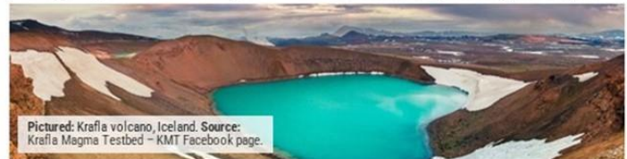
Pictured: Krafla volcano, Iceland.

It's all about location - magma is molten rock that is trapped underground, it becomes lava when it erupts to the surface and keeps flowing like a liquid!