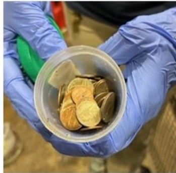
Pictured: Thibodaux, the 36-year-old leucistic American alligator (below) and the coins removed from Thibodaux's stomach (above).