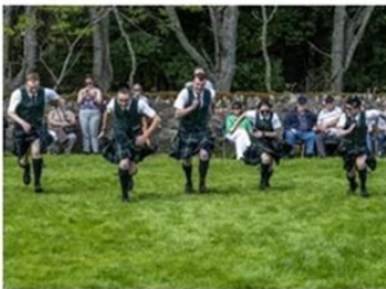
Picture: People taking part in the Highland Games held in Cabrach last year.