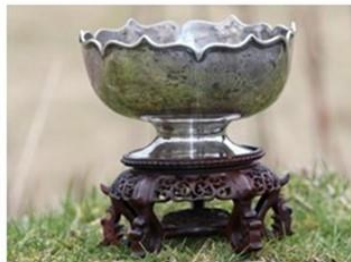
Picture: The Cabrach Rose Bowl Trophy.

A Highland Games trophy, missing for 90 years, has been located! An appeal to find the missing Cabrach Rose Bowl trophy has resulted in the award being found in Devon, southwest England and returned home to Cabrach, a hamlet in Moray, Scotland. The Cabrach Trust, an organisation committed to regenerating local communities, brought back the Cabrach Picnic and Games in 2022, after an 87-year gap. The Cabrach Picnic and Games was a staple of the Highland Games calendar and ran annually from 1877 to 1935. The recently-found silverware was traditionally awarded to the top-performing athlete at the Games. Attendees at the event held in 2023 could enjoy 'have a go' Highland Games, tug o' war, Highland dances, music, food and drink. Highland Games events typically include the caber toss (throwing a very large log as far as possible), hammer