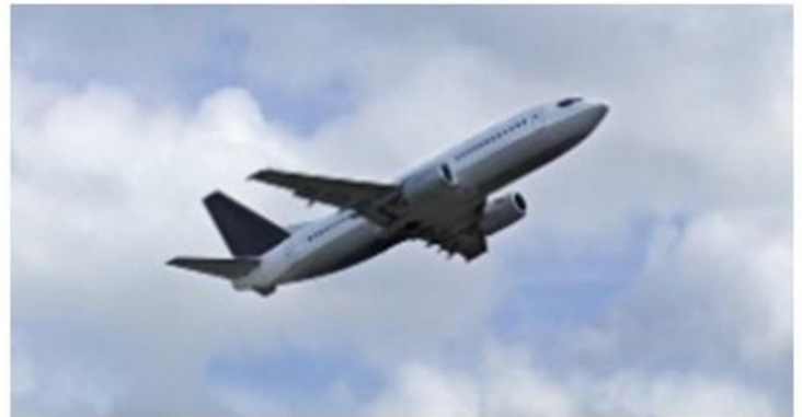
Pictured: A flying plane.

Unusually high winds in the Atlantic jet stream have pushed passenger planes to supersonic speeds! Experts say the near record-breaking wind speeds are due to very cold temperatures in the northeast USA and much warmer air in the south. One commercial flight, travelling from Washington to London, was pushed to nearly 800mph. Another flight from New Jersey's Newark Airport to Lisbon, in Portugal, reached speeds of 835mph. This is much faster than a passenger aeroplane's typical flying speed, which would normally be around 575mph. 'This evening's weather balloon launch detected the 2 nd strongest upper-level wind recorded in local history going back to the mid-20 th